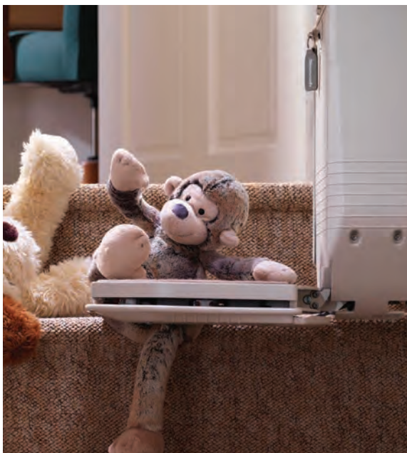
Sensors detect obstructions on your stairs