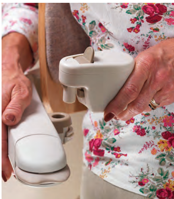
Seatbelt can be fastened with one hand

Effortless and simple. This sums up beautifully just how much thought and care we have designed into each and every function of our Sadler stairlift. From the safe and easy-to-use seatbelts, to stairlifts that fit on either side of the stairs and on all types of staircases, we have made your Sadler stairlift simple, safe and reliable.