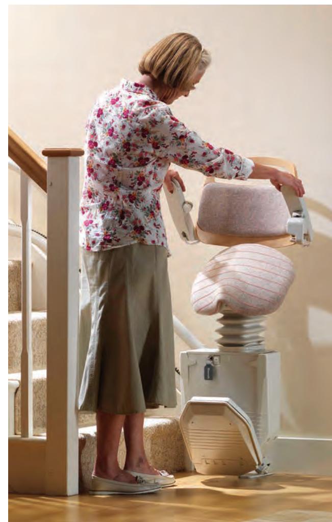
Fold the arms and the footrest folds automatically

“We are delighted with the stairlift. My wife enjoys the ride. It gives her independence. She finds it very easy to use”