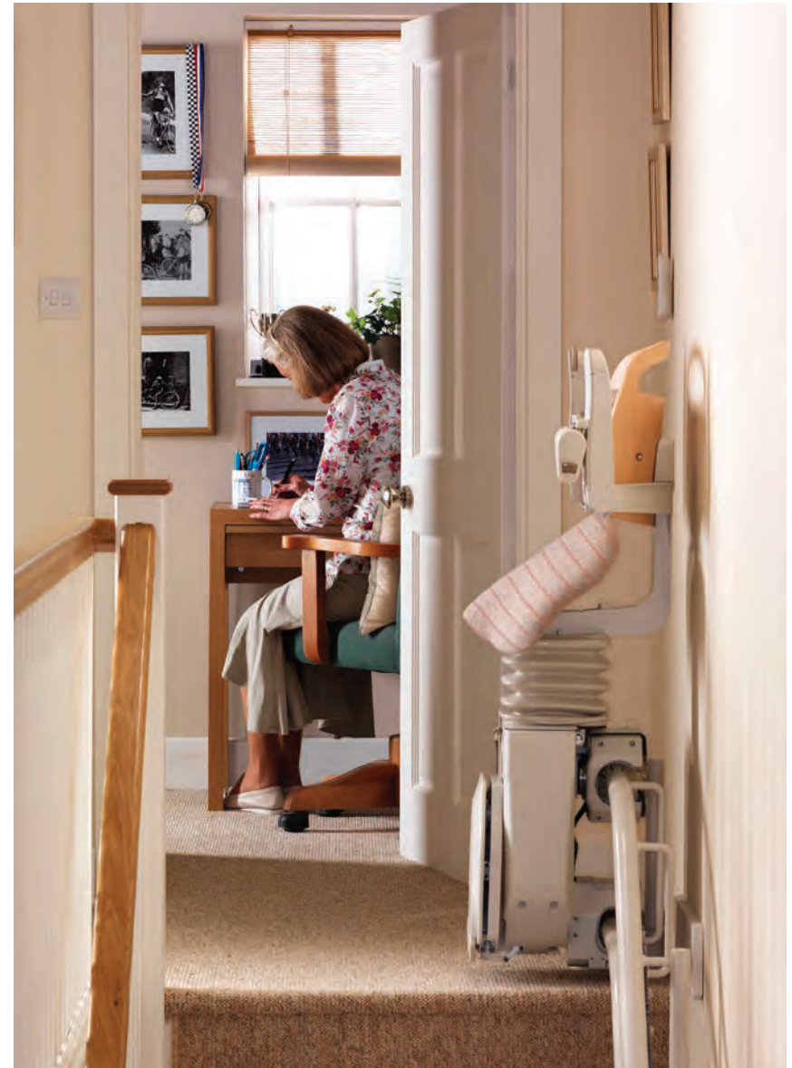
The Sadler's slimline design allows others to still use the stairs

The elegant Sadler is crafted for choice and ease-of-use in every way, with the chair folding away for a compact footprint allowing other people to continue to use the stairs. It's this level of thought and care that ensures that Sadler is the natural choice.