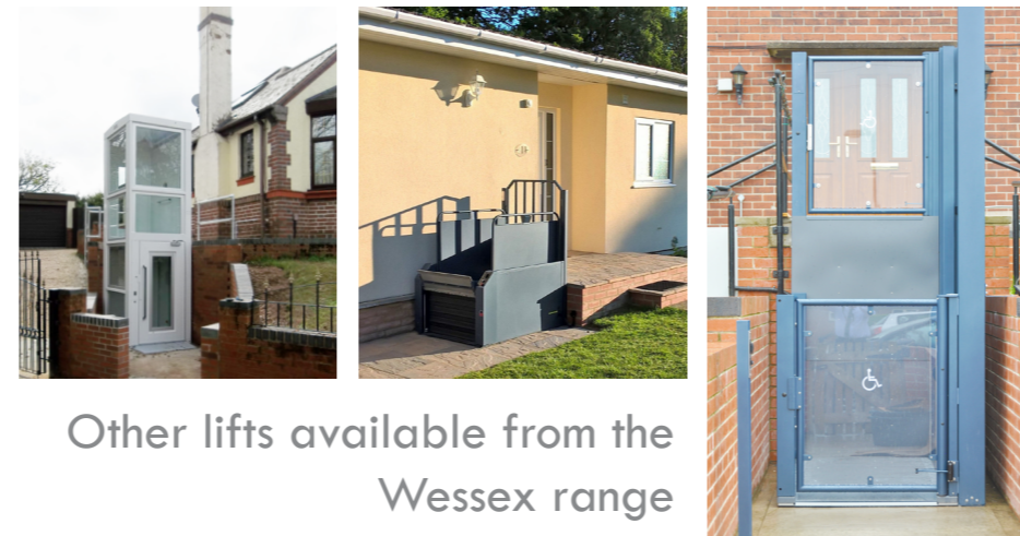
Other lifts available from the Wessex range